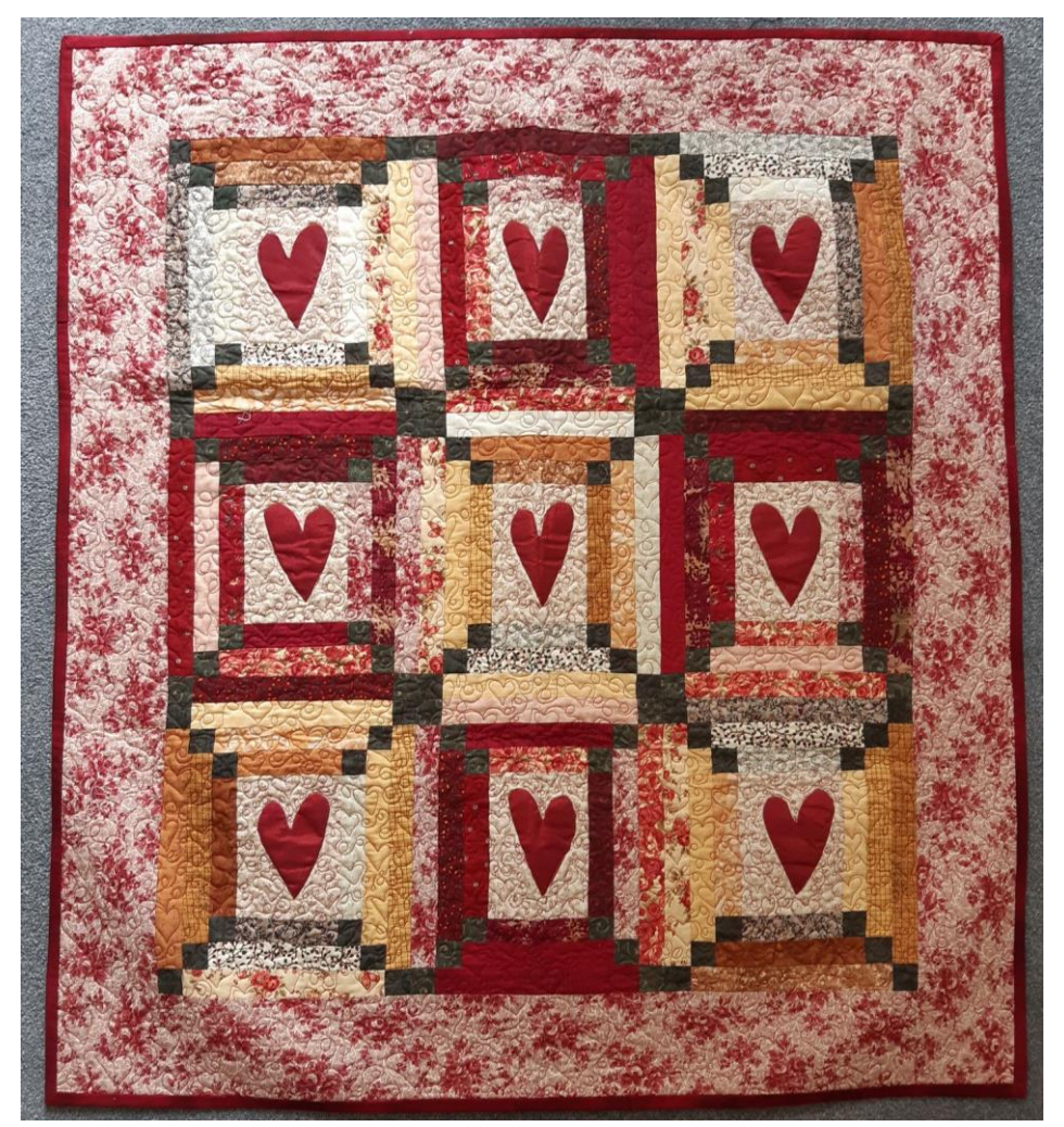
Approx. finished size: 38" by 44" By Valerie Nesbitt